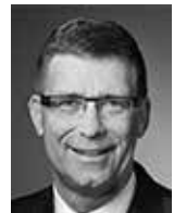
J. Jay Park